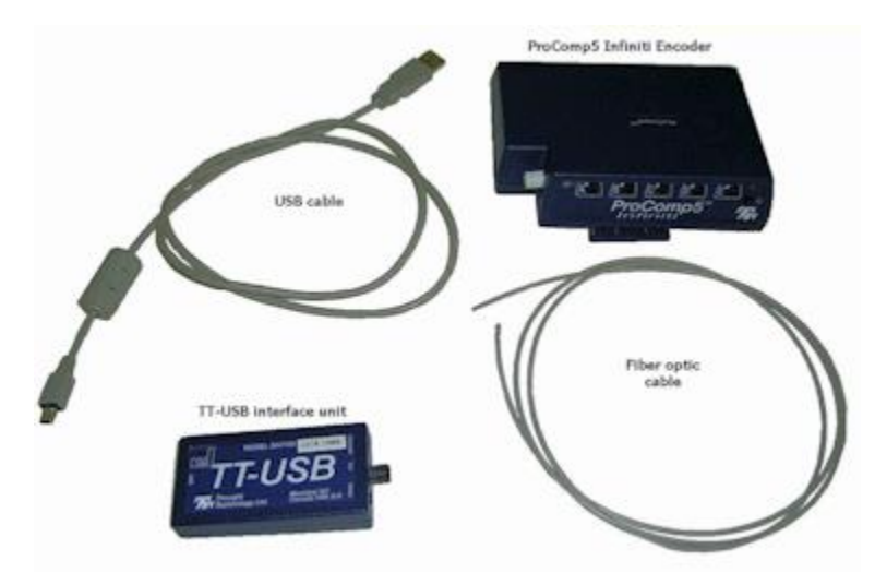
Unconnected hardware components