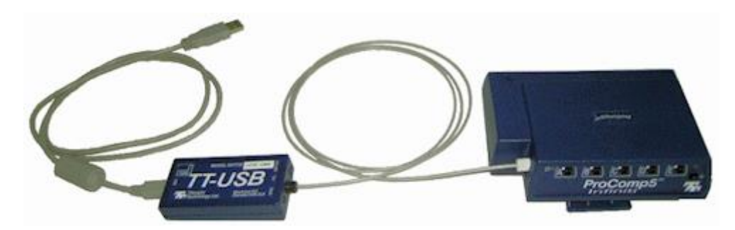
Connected hardware components

The TT-USB interface device has two additional optional connection options.